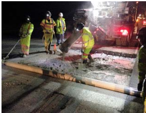
Replacing concrete panels on I-5 near Woodland is tough work, and keeping them safe is our top priority.

When you think about it, each one of those workers has a family who expects them to come home at the end of the shift - you can't put a price on that. It seems the money spent for the mobile barrier was worth every penny. While it may not make sense for every roadway project, we're now looking at ways to use mobile barriers on more of our construction and maintenance jobs around the state.