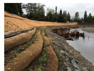
New plantings along the Pilchuck River