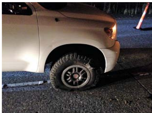
Damaged tire on the vehicle of a suspect in a work zone collision.

A mobile barrier is a new tool we're testing to create a safer separation between traffic and our work zones. Each unit is a big steel wall connected to a truck trailer that can be parked or pulled along the highway while road work is being done. I don't know about you, but I'd rather work behind a metal wall than a plastic cone when up against traffic going 60 mph.