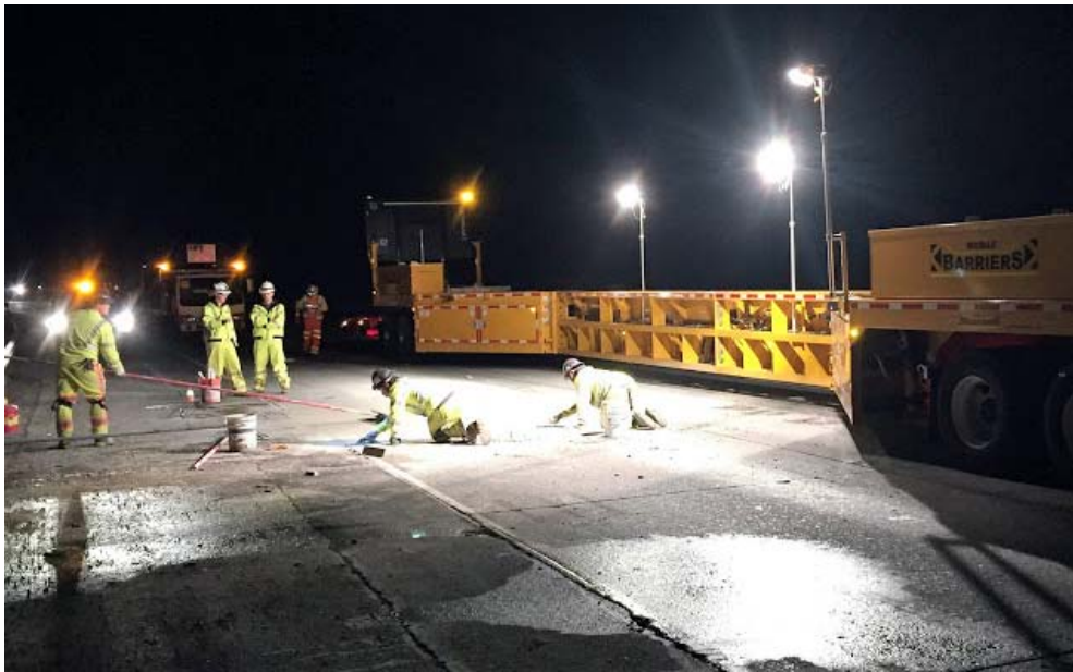
A mobile barrier helps keep our workers safely separated from traffic.

I mean, look at the crew in the photo above, they are kneeling on the roadway, less than 20 feet from interstate traffic! While mobile barriers are designed to create a safer work zone, they have an added benefit of reducing the amount of time workers are on the highway, and the time traffic is delayed by construction.