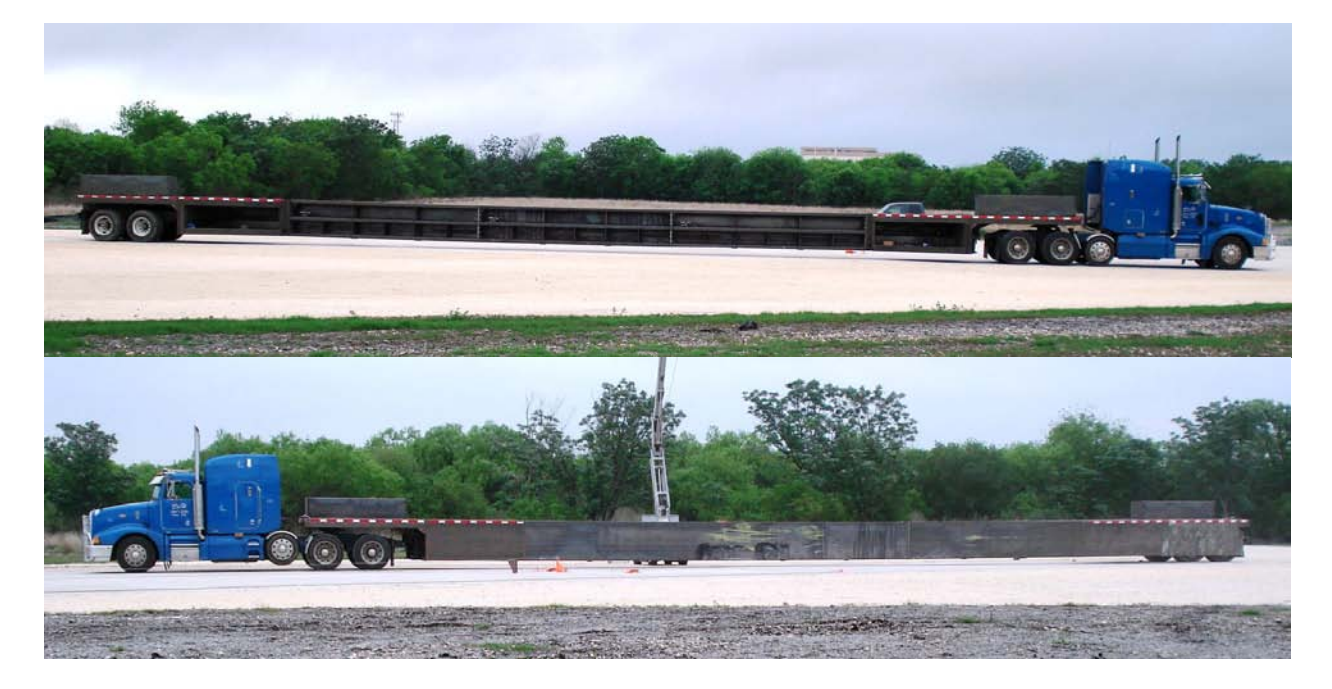
Shortened configuration prepared for transport w/ wall sections atop adjoined platforms.

View as assembled with three wall sections